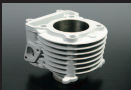
Ceramic plated cylinder