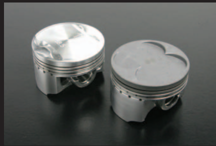
Piston : L.Hi-compression/R.Standard