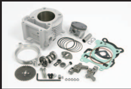
S-Stage Bore Up Kit 156cc