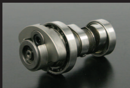
Camshaft (Auto decompression)

※Cannot use ON/OFF switch and not for HID (discharge) head light.