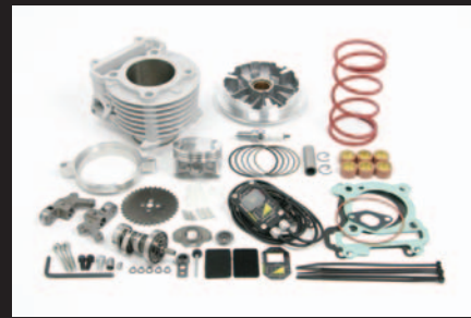
Hyper S-Stage Bore Up Kit 156cc (FI only)