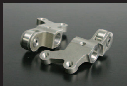
Roller rocker arm