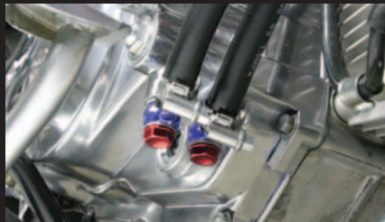
Oil cooler adaptor