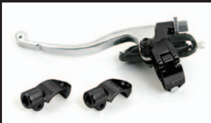
Quick Clutch lever SSY.