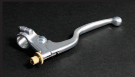
Standard Clutch lever ASSY.