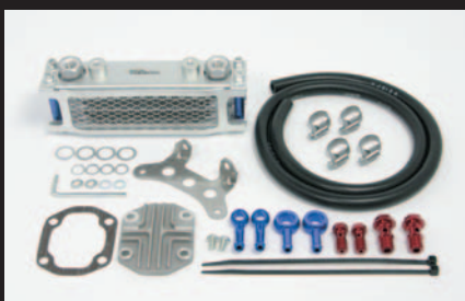
3-fin 4-oil line