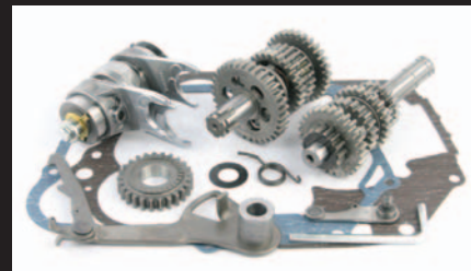
5-speed close ratio transmission