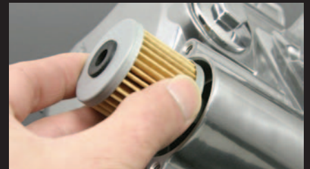
Paper type oil filter

Will be changed to manual clutch by installing a Special clutch Kit.