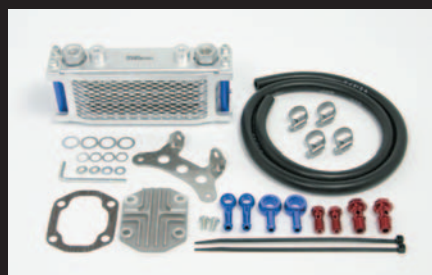
4-fin 5-oil line