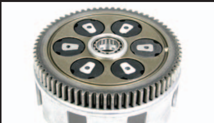
Primary driven gear (Rubber damper built-in unit)