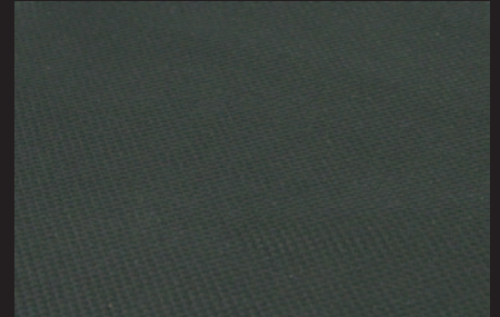
Non skid seat skin