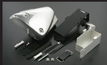
Battery Relocation & side cover set