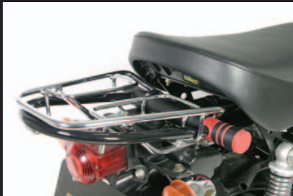
Corresponding to the stock rear carrier