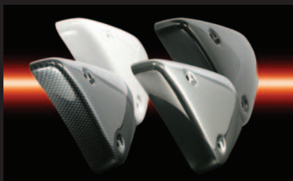
TAKEGAWA's Left side cover