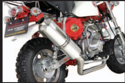
BOMBER (Stage-3) exhaust system