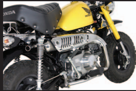
Z Style exhaust system