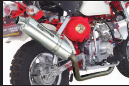
Basic exhaust system