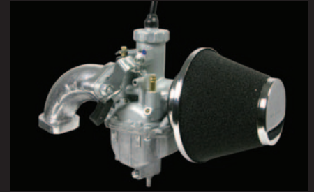
MIKUNI VM22 Carburetor