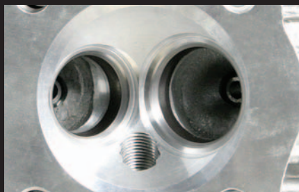
firing camber detail