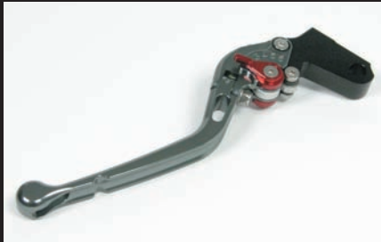
Clutch lever for CBR250R

CBR250R: +Approx.20mm Ninja250R: +Approx.15mm