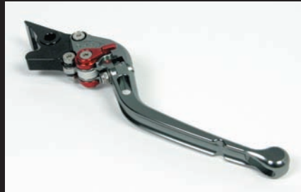
Brake lever for CBR250R