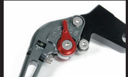
Adjust lever (six stages)