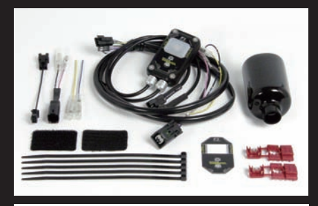
FI CON2 (Injection controller)