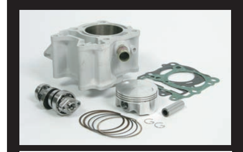
S-Stage Bore Up Kit 170cc