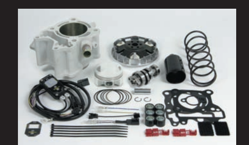
Hyper S-Stage Bore Up Kit 170cc