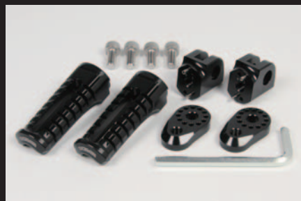
Black (For KAWASAKI)