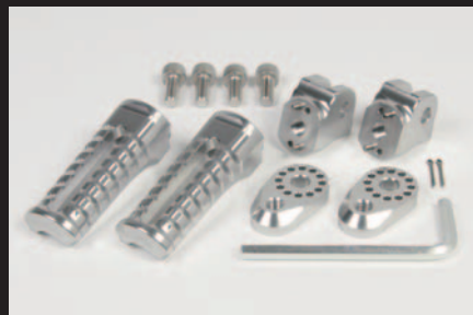
Silver (For HONDA)

※The step position of some bikes cannot be up. (Such as CBR250R)