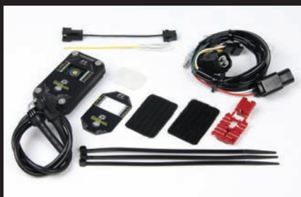
FI CON2(Injection controller)