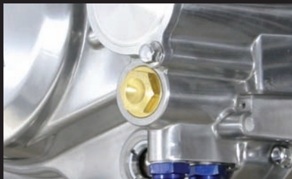
The thermostat mounting unit