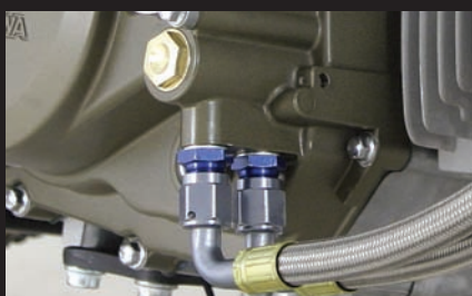
Oil outlet to the oil cooler