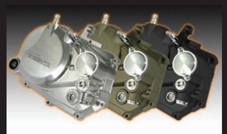
Aluminum die-cast clutch cover