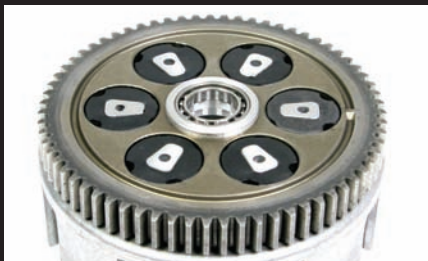
Internal structure primary driven gear