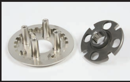
Clutch pressure plate and Clutch camshaft