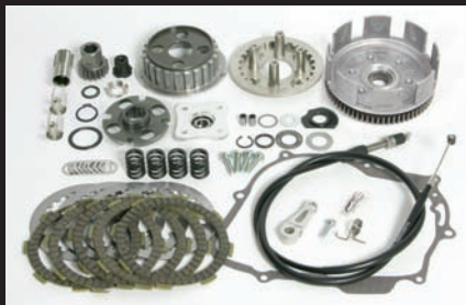
Special Clutch Standard Kit