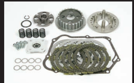
Slipper Clutch Version up Kit