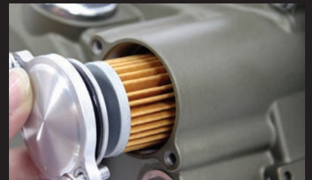
Paper type element oil