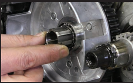
Adapter for stock main shaft

Slipper clutch, slide the clutch and the engine starts and sudden braking miss the back torque. Hopping rear tire by the engine brake, reduce the burden on the engine.