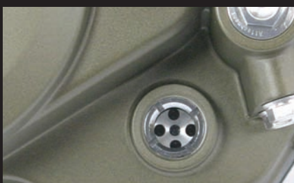
Engine oil check window