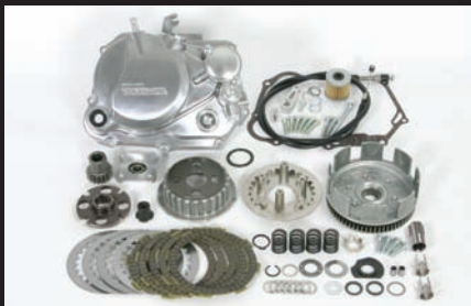
Special Clutch Kit

※ Structure,at the start of the engine, clutch slippage occurs,recommend the use of the decompression cam made by our company.