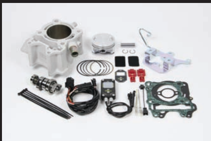
S-Stage eco α Bore Up Kit 170cc

※Ignition device external goods,Do not wearing at the same time that it becomes the cause of product failure.