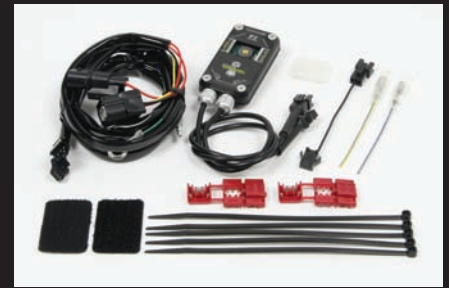
FI CON 2