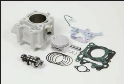
S-Stage eco Bore Up Kit 170cc

※Ignition device external goods,Do not wearing at the same time that it becomes the cause of product failure.