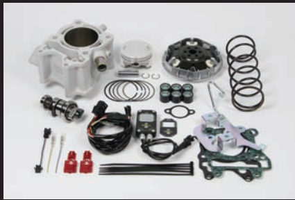
Hyper S-Stage eco α Bore Up Kit 170cc