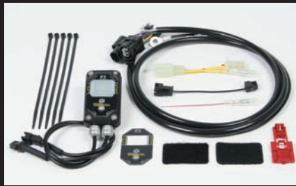
FI CON2 (Injection controller)