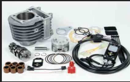
S-Stage α Bore Up Kit