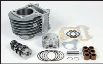
S-Stage Bore Up Kit