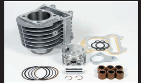
S-Stage Bore Up Kit (less camshaft)