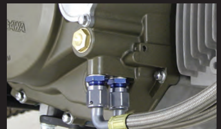
Oil cooler outlet (case installing)