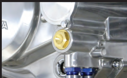
Thermostat (sold separately) case installing