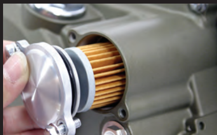
Oil element (paper type)