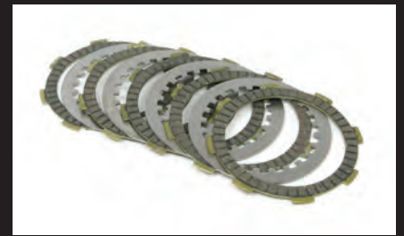
Five specifications friction disk