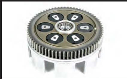
Internal structure primary driven gear (Built-in rubber damper)