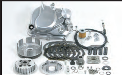
Special Clutch Kit

Aluminum die-casting clutch cover provided are clutch cover our original patent structure with excellent maintenance. It can be mounted thermostat separately, making it ideal for cool over prevention. Cartridge type oil element and oil sight glass, oil outlet of the oil cooler, oil cooler kit clutch cover taken out of our type can be used. Clutch cover 3 types of buffing clear paint, brown paint, the black paint.