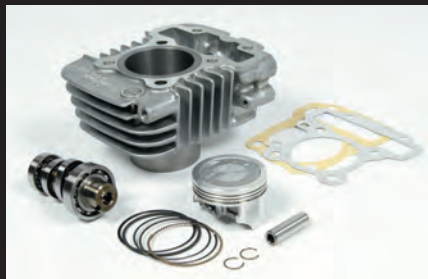
S-Stage Bore Up Kit 81cc