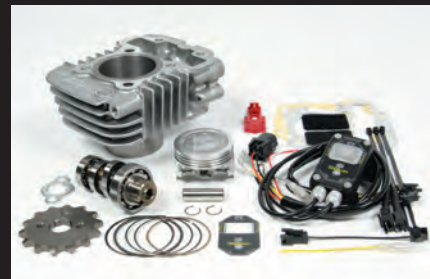
Hyper S-Stage Bore Up Kit 81cc