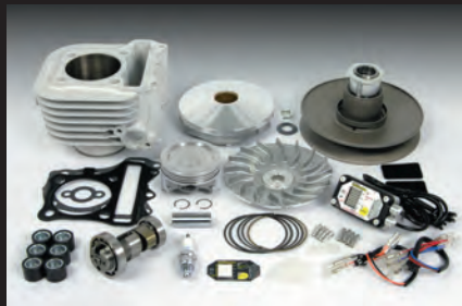
Hyper S-Stage eco α Bore Up Kit 161cc