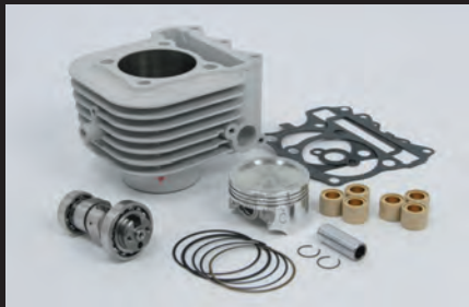
S-Stage eco Bore Up Kit 161cc

Controller can be changed a fuel increase correction settings easily by switch. It has some built-in setting data which is suitable for our custom engine parts.