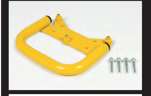
Steering handle guard