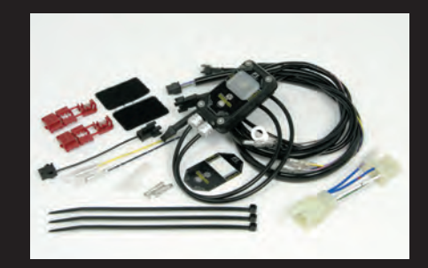
FI CON2 (Injection controller)