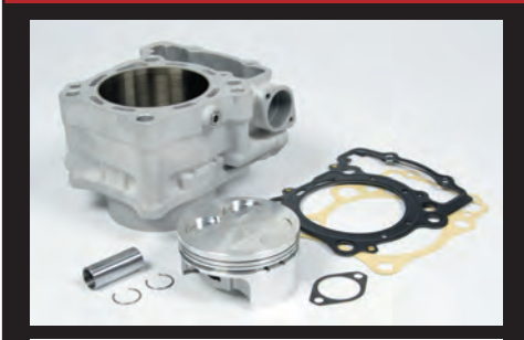
Bore Up Kit 305cc

*Don't install other's Ignition device simultaneously. It would cause malfunction or product failure