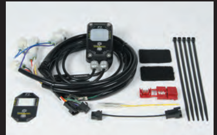
FI CON2(injection controller)