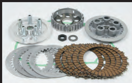
Slipper clutch kit(with disk plate)

At the downshifting rapidly, the slipper clutch will slip the clutch for relieving the back torque. It is possible to reduce the burden on the transmission, hopping of rear tire by the engine brake. ※If there are damage or wear in your friction disc, clutch plate or springs, please purchase the 02-01-0111.(with disk plate)