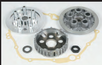
Slipper clutch kit