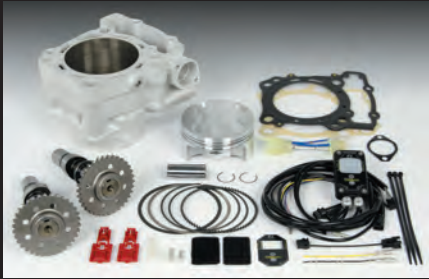
Hyper Bore Up Kit(CBR250R)

※CRF250L will be subject to (05-04-0015) FI CON2.We don't confirm it in CRF250M.