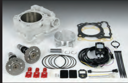
Hyper Bore Up Kit(CRF250L)