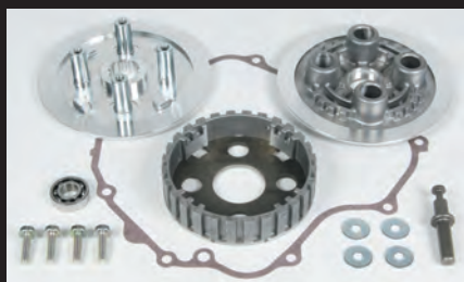
Slipper clutch kit