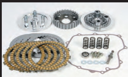
Slipper clutch kit(with disk plate)

※If there are damage or wear in your friction disc, clutch plate or springs, please purchase the 02-01-0108.(with disk plate)