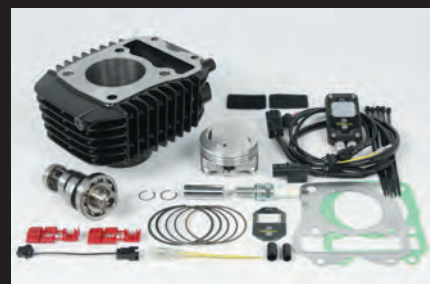
Hyper e-Stage Bore Up Kit 143cc