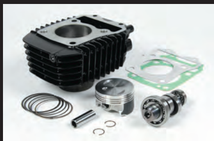
e-Stage Bore Up Kit 143cc

It is a bargain kit that the FI CON2 (injection controller) and the spark plug is attached to the e-stage bore up kit 143cc (Sports camshaft attached).