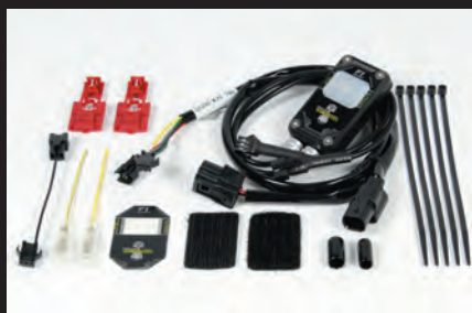
FI CON2(injection controller)