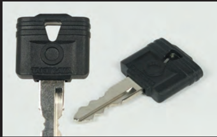
Original piston shaped key