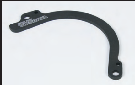
Sprocket guard plate

For correcting the error, our speed sensor kit (coming soon) for genuine speedometer is required.