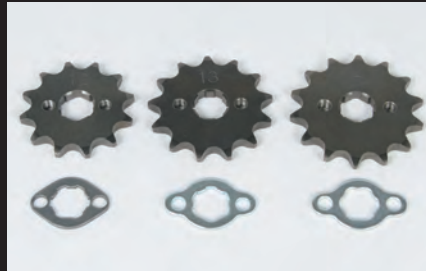
Standard type: 12T, 13T, 14T