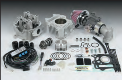
Hyper R-Stage Bore Up Kit 88cc

It is a bargain kit that the FI CON PLUS(injection controller) , Big throttle body kit and the spark plug is attached to the R-Stage Bore Up Kit 88cc.