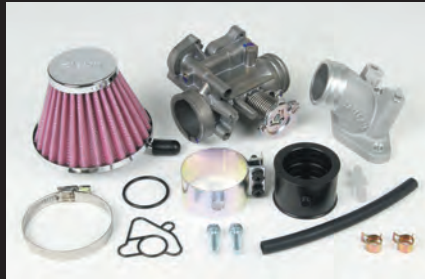
Big throttle body kit