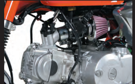
Big throttle body kit