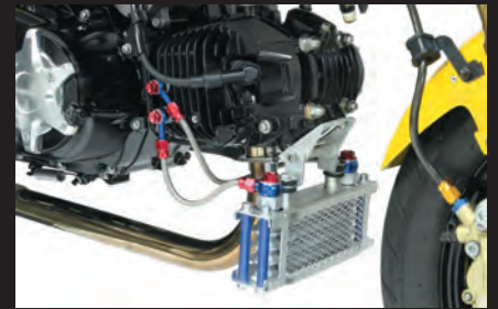
installation of the oil cooler kit