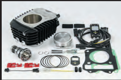
Hyper S-Stage bore up kit 181cc