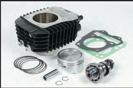
S-Stage bore up kit 181cc

It is a bargain Kit including S-Stage Bore Up Kit 181cc (with sports camshaft), FI CON2 (injection controller) and a spark plug.