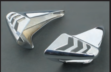
Rear turn signal cover (09-11-0149)