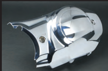
Clutch cover (09-11-0153)