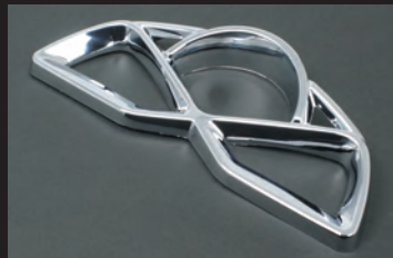
Meter cover (09-11-0146)