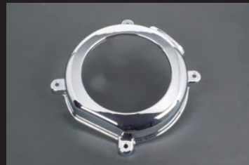
Filter cover trim(09-11-0150)