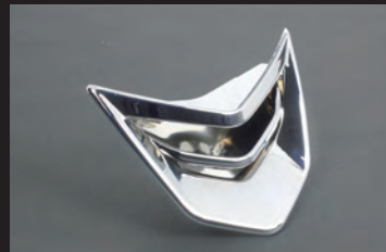
Air duct cover (09-11-0145)

■ Clutch cover: Remove the stock clutch cover and attach our clutch cover by re-using the stock bolts.