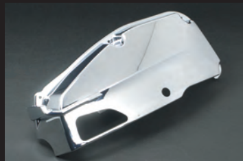
Air cleaner cover (09-11-0152)