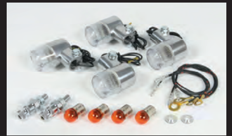
Round type S turn signal kit(Clear lens)