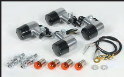
Round type S turn signal kit(Smoke lens)