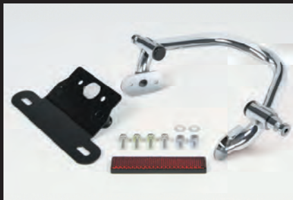
Rear fender guard set(Chrome plated)