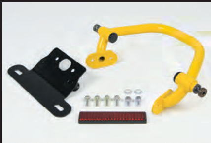
Rear fender guard set(Pearl corn yellow)

※If you would like to attach the rear turn signals, it is necessary to purchase our rear fender guard set separately.