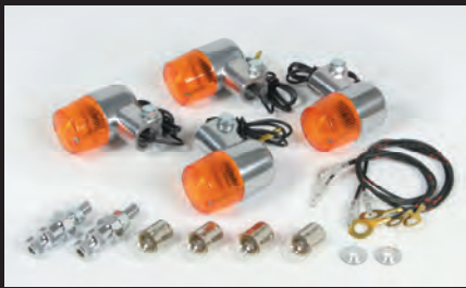
Round type S turn signal kit(Orange lens)