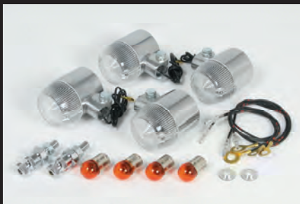
Round type M turn signal kit(Clear lens)