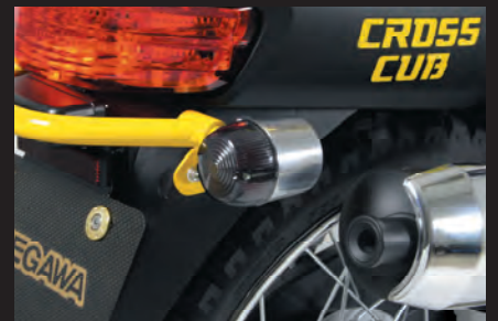
Round type M turn signal kit(Rear)