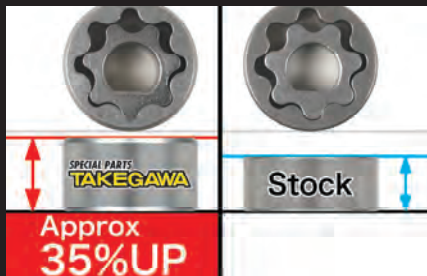
Comparison of thickness of the trochoid Left: Super oil pump Right: Stock pump