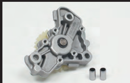
Super oil pump kit

※Please be sure to use the knock pin of this kit.