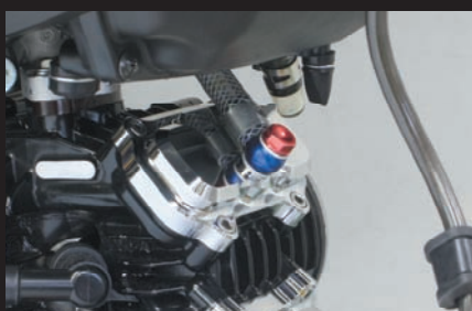
Can be connected to the inspection breather cover of our Super head 4V + R cylinder head.