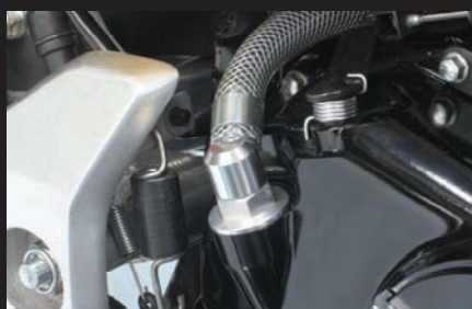
Breather cap (swivel type) attached