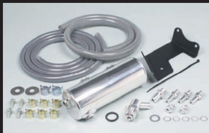
Oil catch tank kit

※Because the breather cap does not have the oil level gauge, please use genuine oil level gauge to check the oil level.