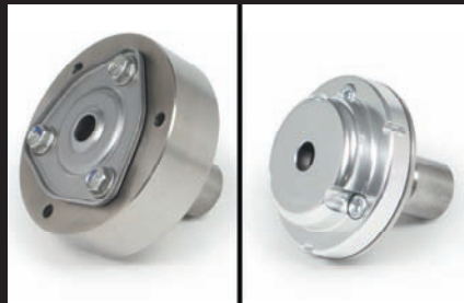
Shape comparison (Left : Genuine Right : Takegawa)