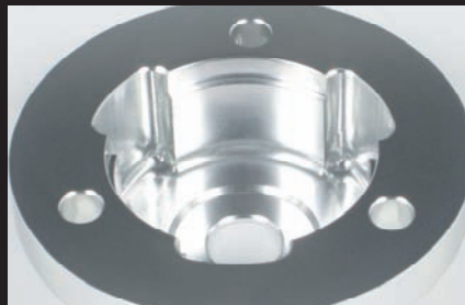
Takegawa centrifugal oil filter unit with pocket shape