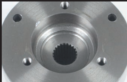
Genuine centrifugal oil filter unit