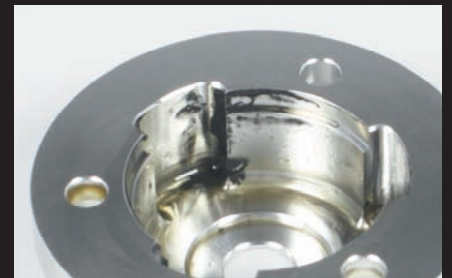
Effect of pocket shape