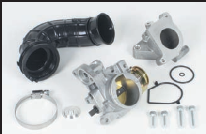
Big throttle body kit