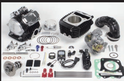
Super head 4V+R combo kit 181cc