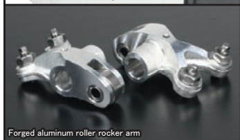
Forged aluminum roller rocker arm