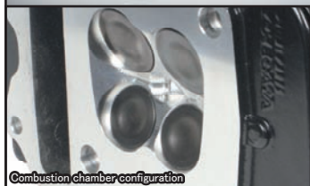
Combustion chamber configuration

It is possible to reduce the frictional resistance between the camshaft, achieved the smooth operation !!