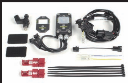
FI CON2 (Injection controller)