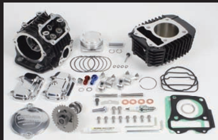
Super head 4V+R bore up kit 181cc

※To attach the big throttle body kit, processing of genuine air cleaner box is required.