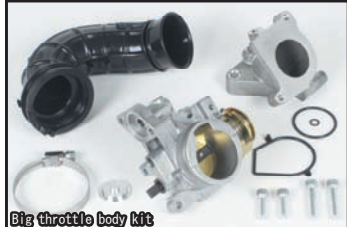
Big throttle body kit