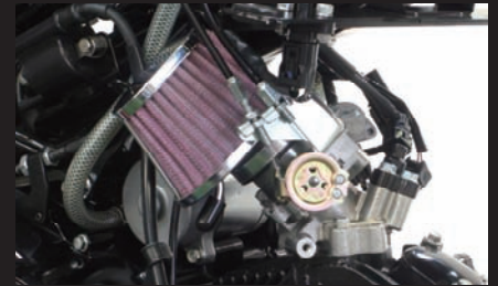
With optional air filter kit