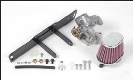
Kit with shroud stay (03-05-0127/03-05-0128)