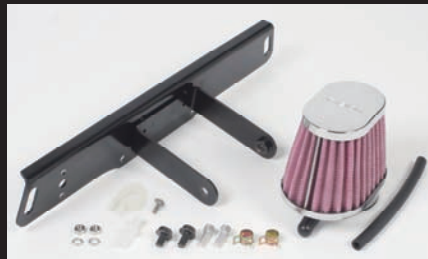
Kit with shroud stay (03-01-0004)