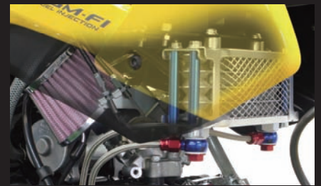
Mounted image (with shroud)