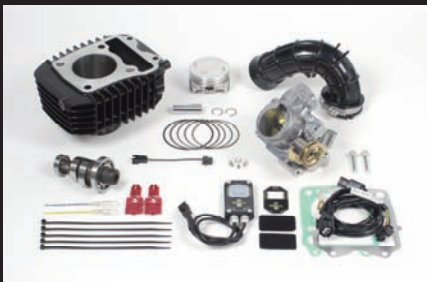
Hyper e-Stage bore up kit 143cc