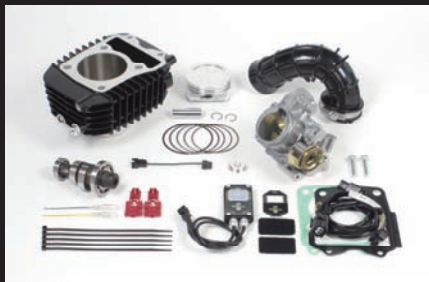
Hyper S-Stage Bore Up kit 181cc