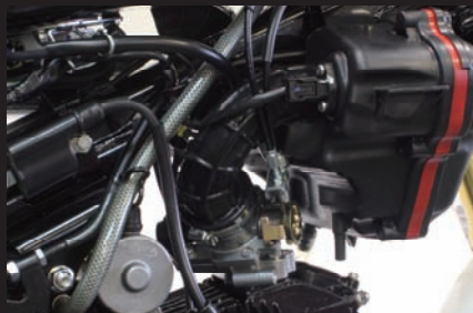
Connecting tube mounted