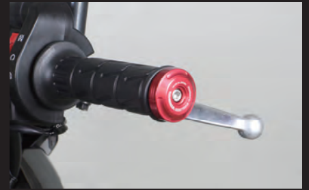
Installation image of billet aluminum bar end.