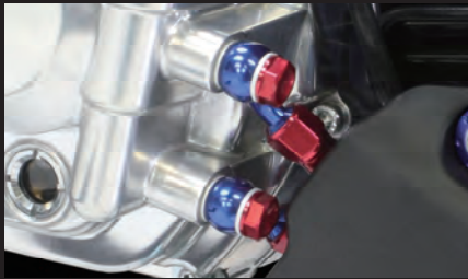
Special clutch cover outlet portion