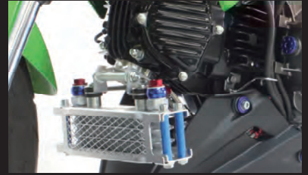
Oil cooler body mounting position