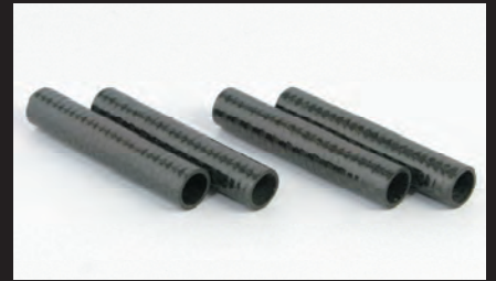
Dry Carbon color pipe kit(option)

Applicable model : Z125 PRO (BR125H-A02621~) / KSR110 (KL110A-000001~) / KSR110(KL110CBF) (JKAKL110CCDA00058~) : KSR110 (KL110DDF) (KL110D-A57002~) / KSR PRO (KL110 EEF) (JKAKL110EEDA88121~)