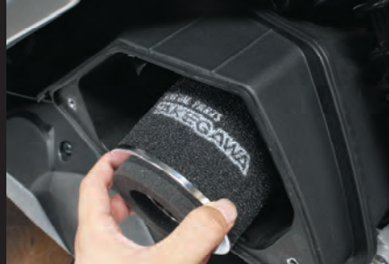
Installation image (Cover of air cleaner box is removed)