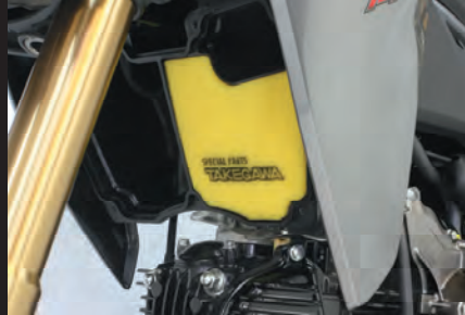
Installation image (Cover of air cleaner box is removed)