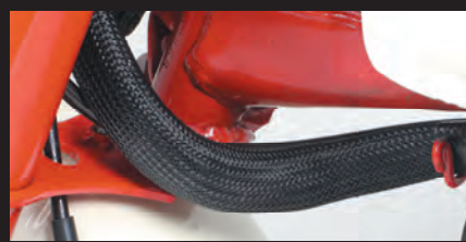
Exposed frame neck area covered nicely by extra mesh tube.