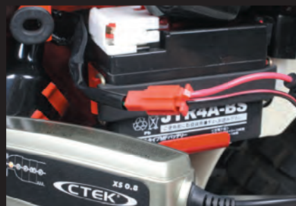
Equipped an extra connector for outer power charging.