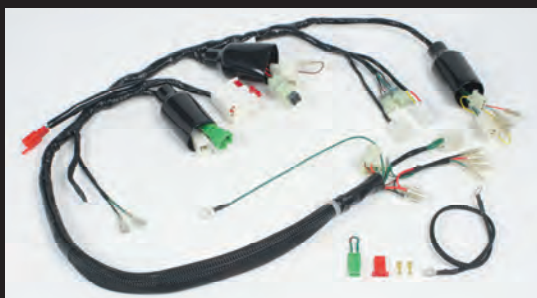
Super main harness kit

※Cannot be used to Monkey BAJA and Monkey R.