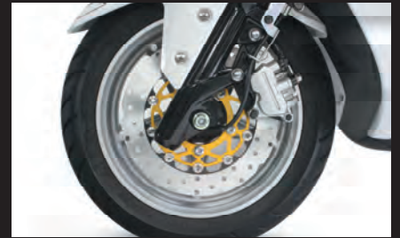
CYGNUS X SR(SEA5J)