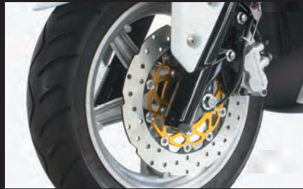
CYGNUS X SR(SEA5J)