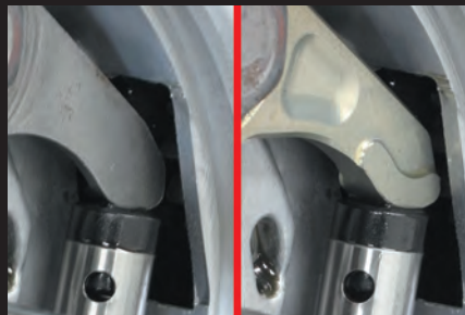
Comparison of push rod contact area. Left: genuine / Right: Takegawa