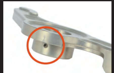
Adopted an oil hole in arm moving part.