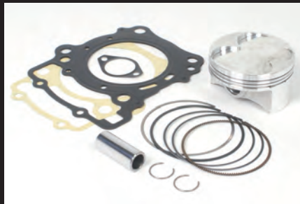
High compression piston Kit