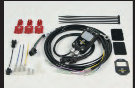
FI CON2 (Injection controller)