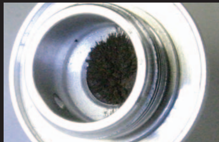
Adsorption image (using the iron sand)