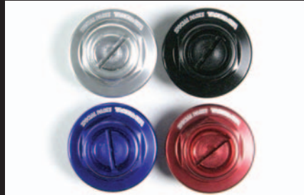
Color line up