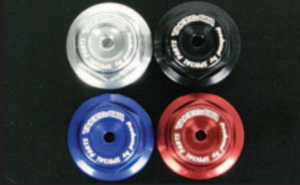
Color line up