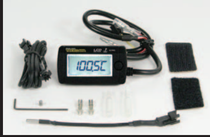
Compact LCD Thermometer