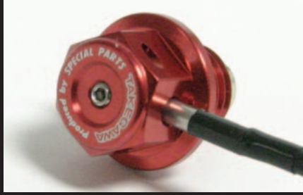
Stick-type temperature sensor