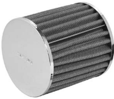
① Paper type